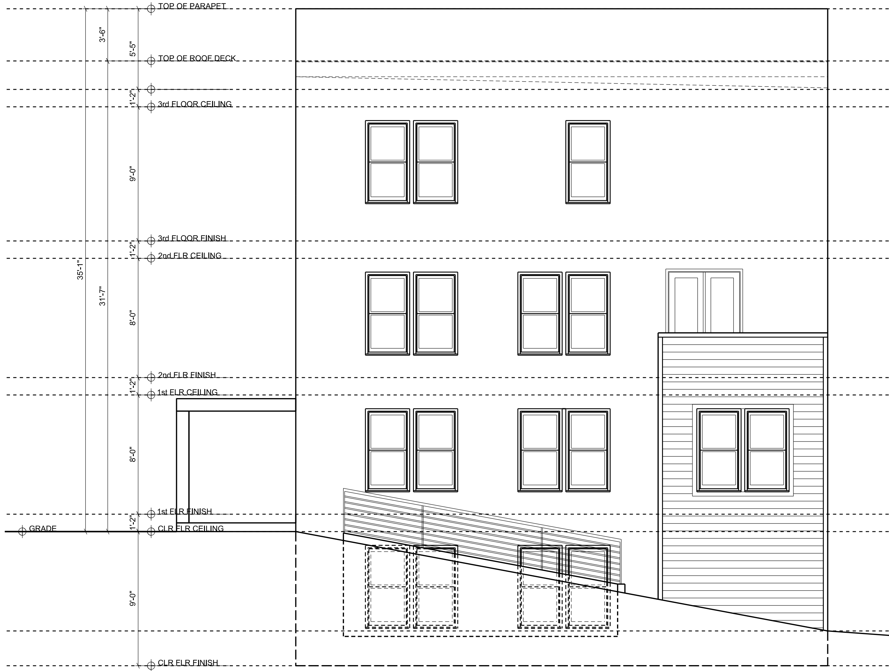
2 WEST ELEVATION - PROPOSED SCALE: 1/4" = 1'-0" 24X36 LAYOUT